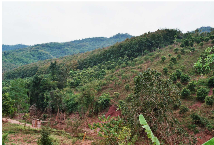
Fig. 1. Reforestation landscape in the northwest of Vietnam. In front, longan ( dimocarpus longan ). Behind, plantation of teak ( tectona grandis ) exploited for wood. In the background, a secondary forest with a mix of trees and bamboos. Picture: P. Meyfroidt, 2008.

In Vietnam, since the early 1990s, after an intense deforestation period, a net reforestation has been observed in the mountains that cover two-thirds of the country (Fig. 1) (De Koninck 1999, Jamieson et al. 1998, Castella and Quang 2002). Policy and economic changes, as well a vigorous reforestation programs have been suggested to be the causes of this reforestation. However, other studies cast doubts on the effectiveness of the government measures to reforest the country, and on the trends in forest cover (Lang 2001, McElwee 2004).