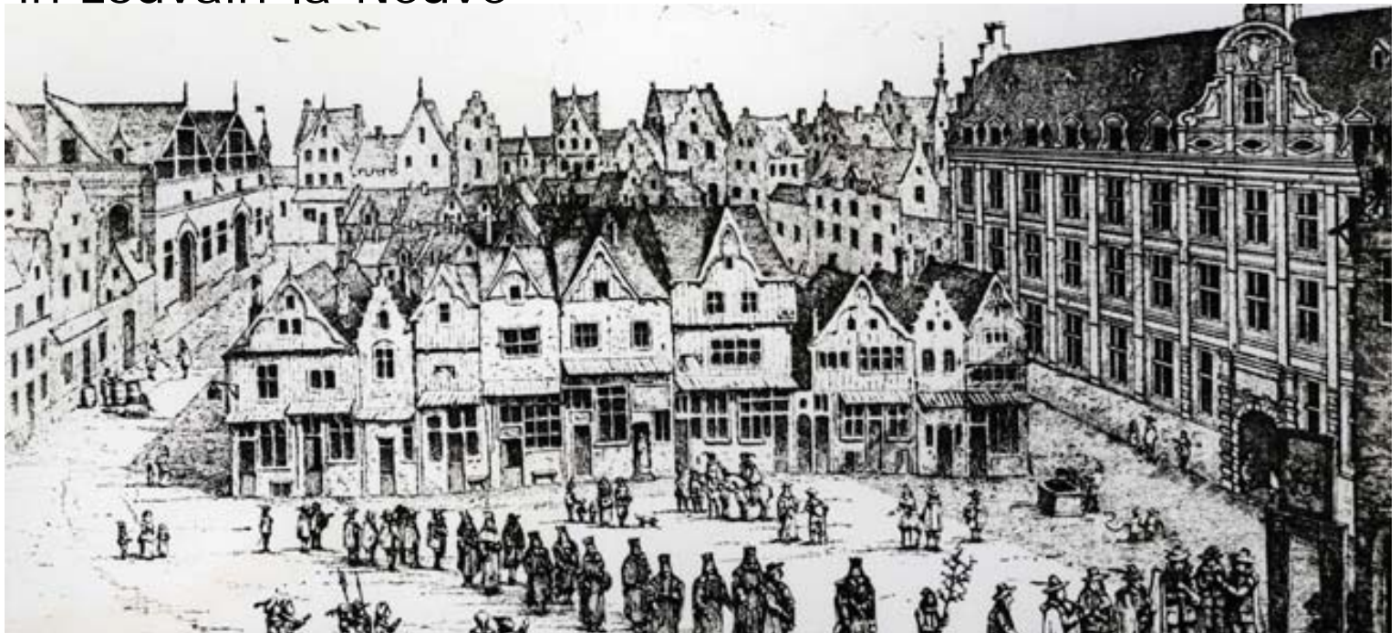
Leuven, graduate procession, 17th century