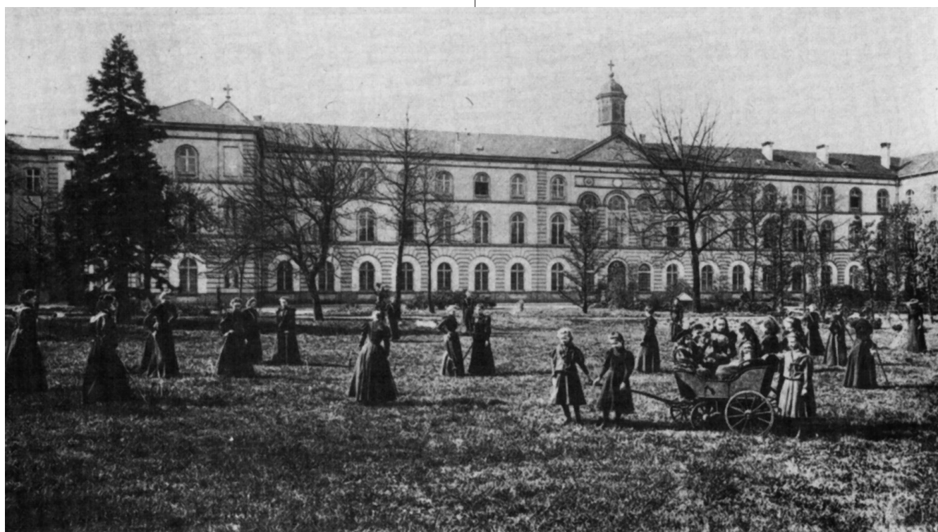
Interior façade of the Berlaymont monastery, 1877

The Belgian government quickly realizes that the uncertainty may last long and that far more office space will be needed. In December 1958, it expresses its interest in acquiring the convent and school of the nuns of Berlaymont, located on the rue de la Loi between the rue Archimède and the boulevard Charlemagne: thanks to the big garden, there would be no need to destroy too many houses in order to make room for a huge office building, that could conceivably be turned into a ministry if European institutions decided to move elsewhere.